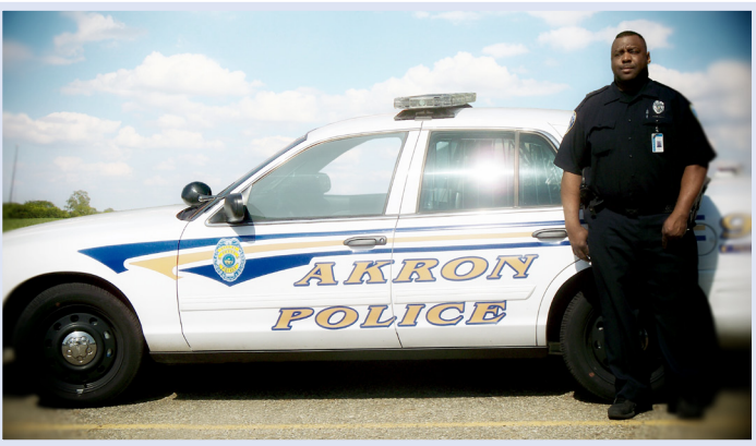
Some (mobile computing) units are big and bulky, and cars are getting smaller and smaller. We were having Trouble getting a solution where the passenger seat wouldn't have laptops or wiring dropped in,